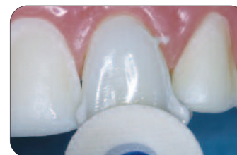
[ Polish ]