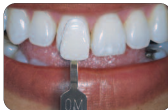
[ Base Shade Selection ]