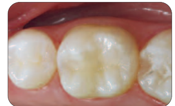
[ Final polished restoration ]

Note: This vertical posterior layering technique is provided to minimize polymerization stress during cure. A traditional horizontal layering technique may be used if desired.