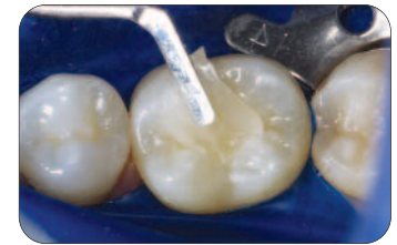
[ Enamel layer applied in 2 vertical increments ]