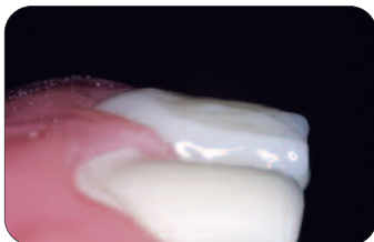
[ Dentin/Body Anatomical layer ]

Note: Apply Artiste® Nano Composite in 0.5mm to 2mm layers maximum.